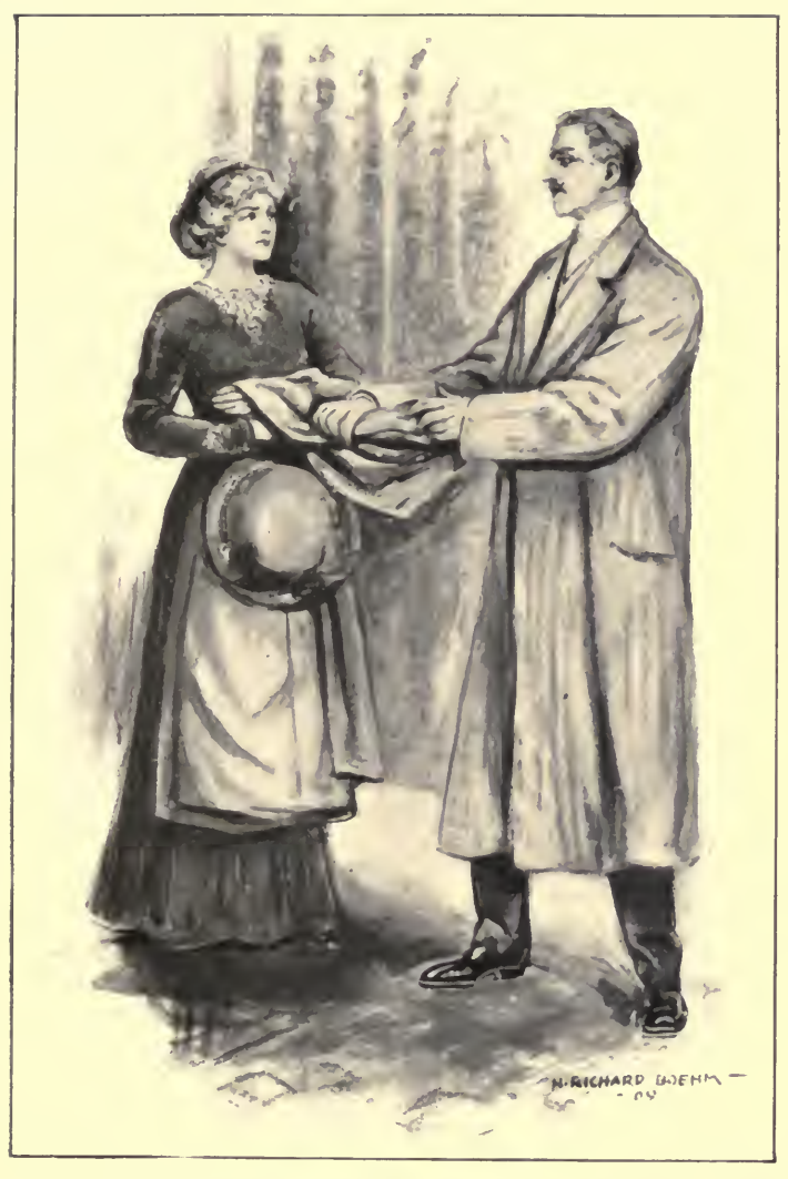
"' I beg you, mademoiselle," interrupted Guerchard. "We are sometimes obliged ——" "